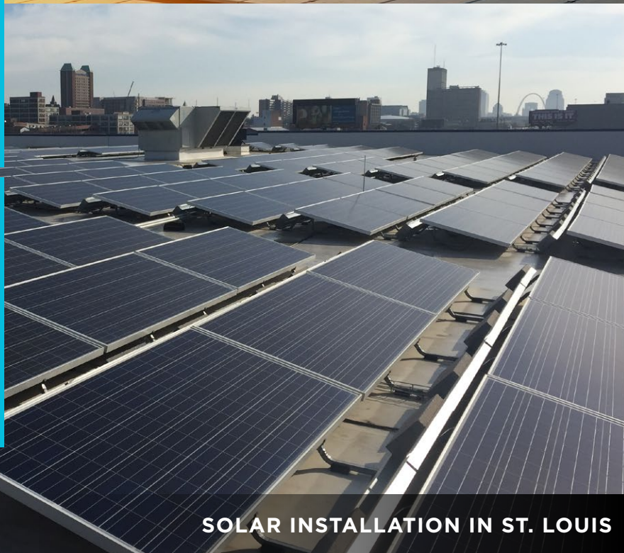
SOLAR INSTALLATION IN ST. LOUIS

THRIVING INDUSTRY: Missouri is home to innovative suppliers for the solar industry