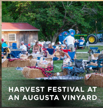
HARVEST FESTIVAL AT AN AUGUSTA VINYARD