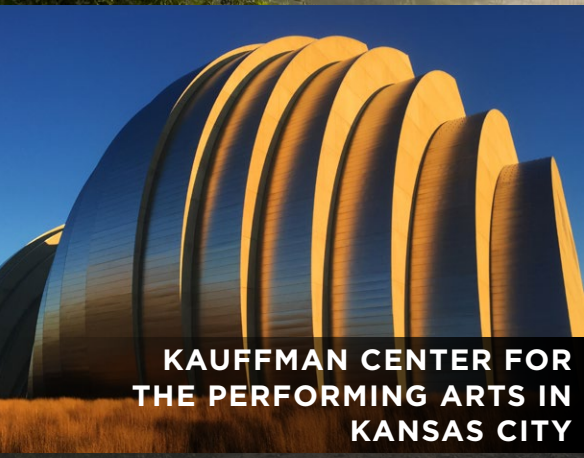
KAUFFMAN CENTER FOR THE PERFORMING ARTS IN KANSAS CITY