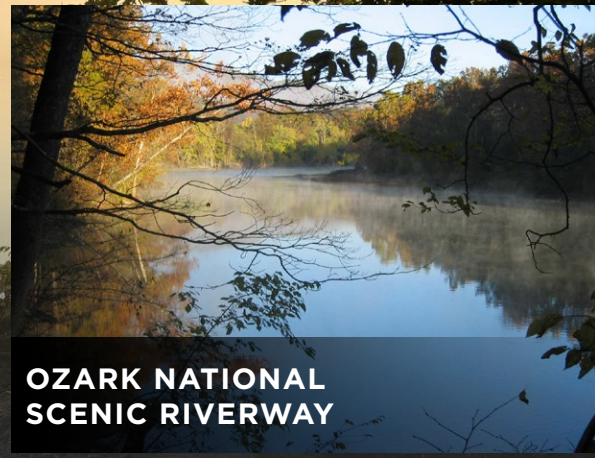
OZARK NATIONAL SCENIC RIVERWAY