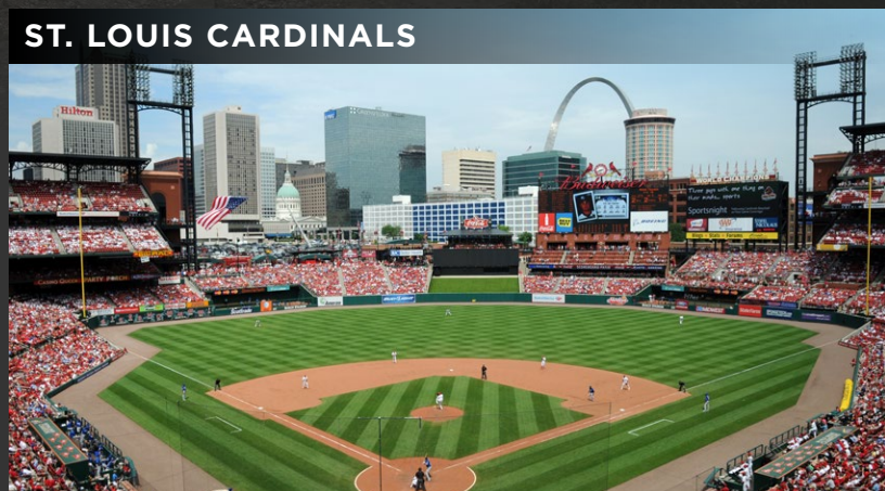
ST. LOUIS CARDINALS

DYNAMIC BUSINESS HUB: Top Companies Proudly Headquartered in Missouri: