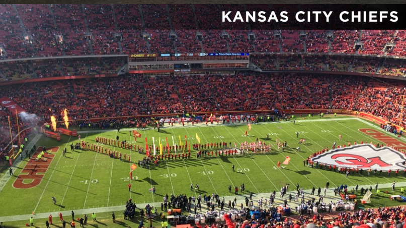
KANSAS CITY CHIEFS