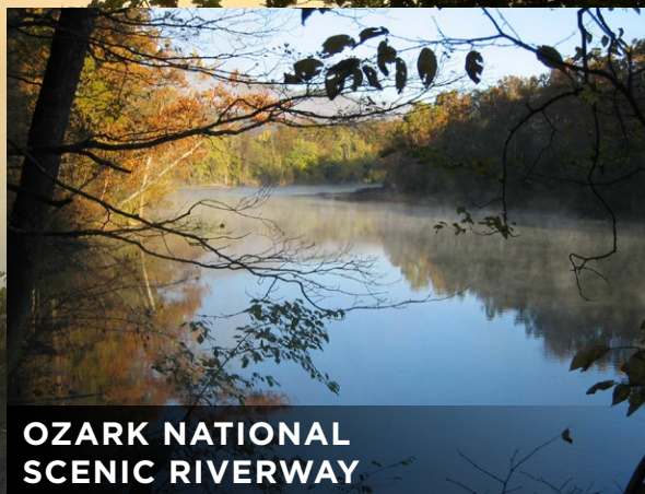
OZARK NATIONAL SCENIC RIVERWAY