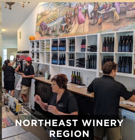
NORTHEAST WINERY REGION