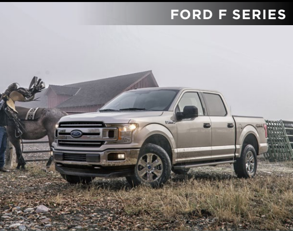
FORD F SERIES